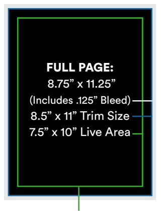
Keep all type, logos and other critical content within the Live Area.

Acceptable file formats: PDF (embed or outline all fonts) and JPG. TIF and PSD also acceptable as long as layers are flattened. Ads created in Microsoft Word or Publisher will not be accepted.